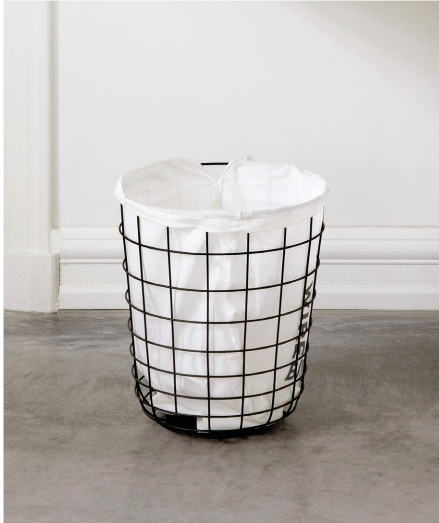
NORM WIRE BIN Designed by Norm Architects