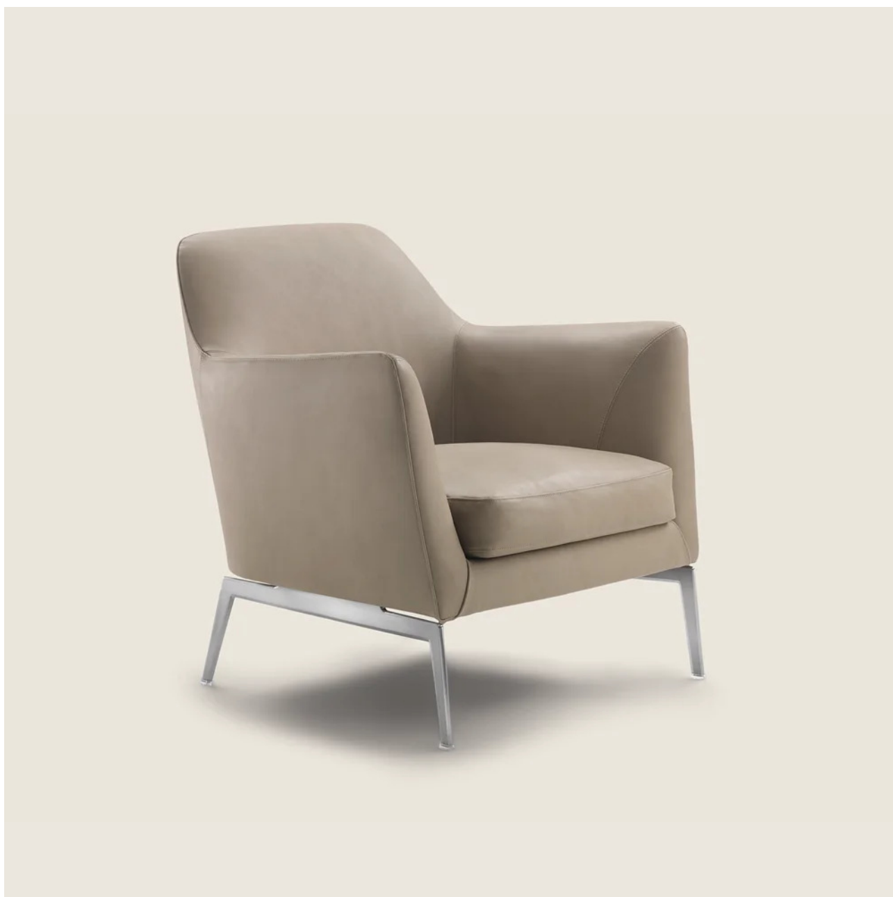
LUCE ANTONIO CITTERIO 2015 ARMCHAIRS