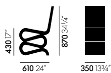
Wiggle Side Chair