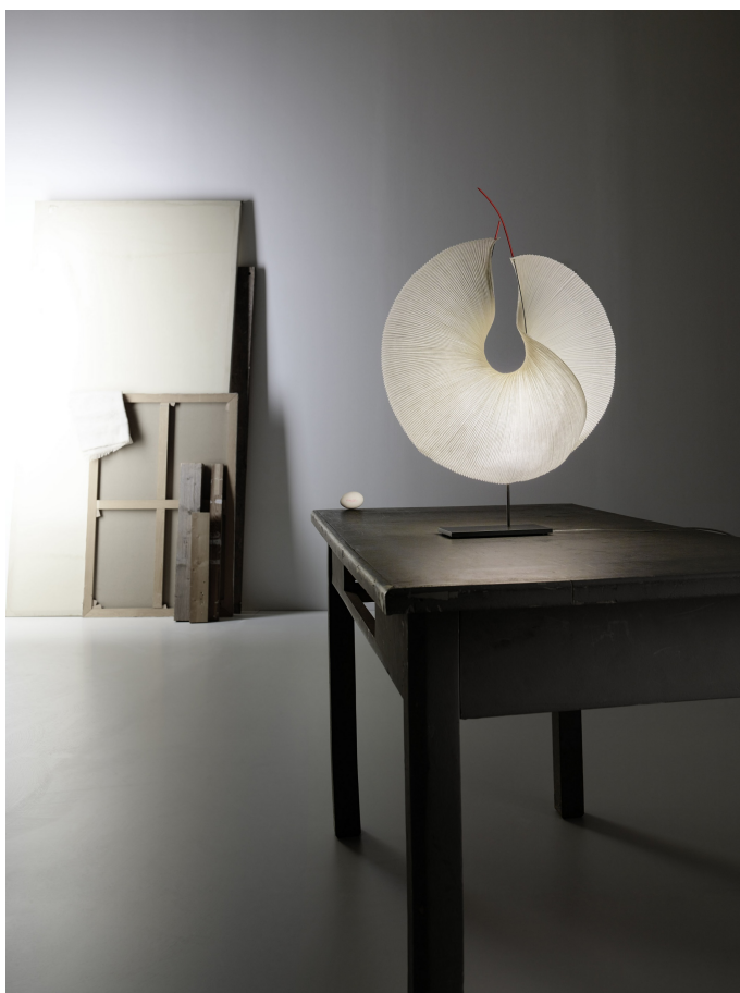
Yoruba Rose DAGMAR MOMBACH, INGO MAURER & TEAM 2017

Paper, metal, stainless steel, silicone. Yoruba Rose is a light object that enchants through perfection and grace. The sheet of paper is almost circularly stretched on light metal wires and strives upwards. The harmonious expression of the model and the extremely pleasant light make it the ideal light source in spaces where one rests. Yoruba Rose can also be produced as a standard lamp on request. Just as in all other MaMo Nouchies, the lampshade consists of Japanese paper, which has to undergo a special manufacturing process in Dagmar Mombach's studio. The light source is an LED module, provided with a cooling element, developed by Ingo Maurer especially for the MaMa Nouchies. The light is warm and soft, and can hardly be distinguished from conventional halogen light. Yoruba Rose is usually available for immediate delivery.