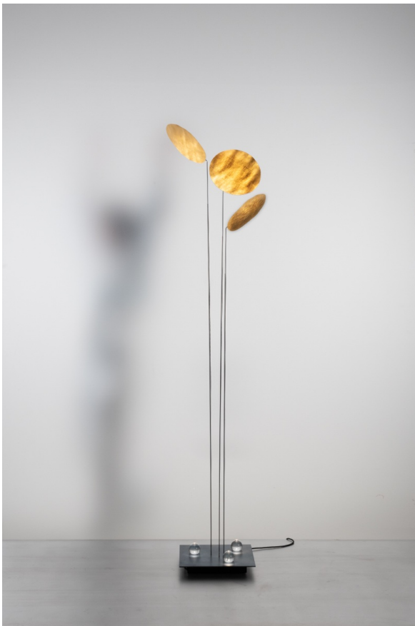
nuunu FLAVIA THUMSHIRN 2023