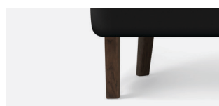
DARK STAINED OAK