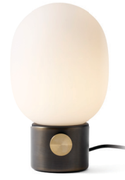
Bronzed Brass 1800859