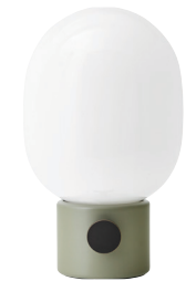
Ammonite Grey, Steel 1800089