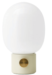
Alabaster White, Steel 1800360