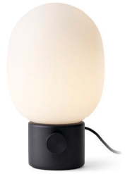
Black Steel 1810539