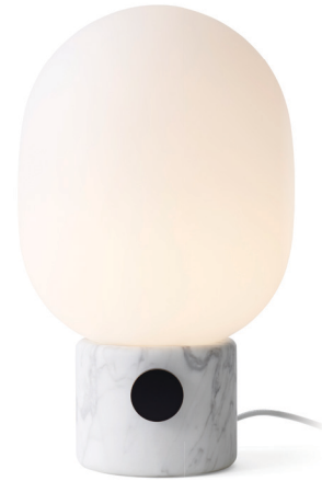
Carrara Marble 1830639