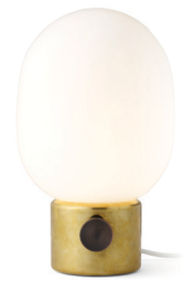
Polished Brass 1800839