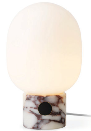
Calacatta Viola Marble 1830319