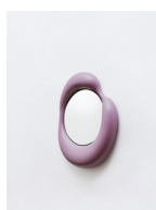
Small Ingres mirror – Auguste