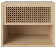
Cana Bedside Table H36 cm

Width 47 cm Depth 30 cm Height 36 cm Producer HMS Furniture Group