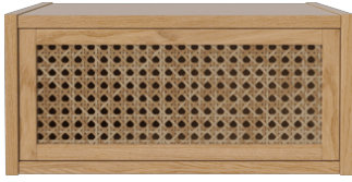
Cana Bedside Table H20 cm

Width 47 cm Depth 30 cm Height 20 cm Producer HMS Furniture Group