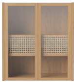
Cana Wall Cabinet

Width 61 cm Max weight capacity 25 kg Height 67 cm Max weight capacity per shelf 10 kg Depth 25 cm Producer HMS Furniture Group