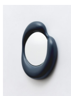
Large Ingres mirror – Dominique