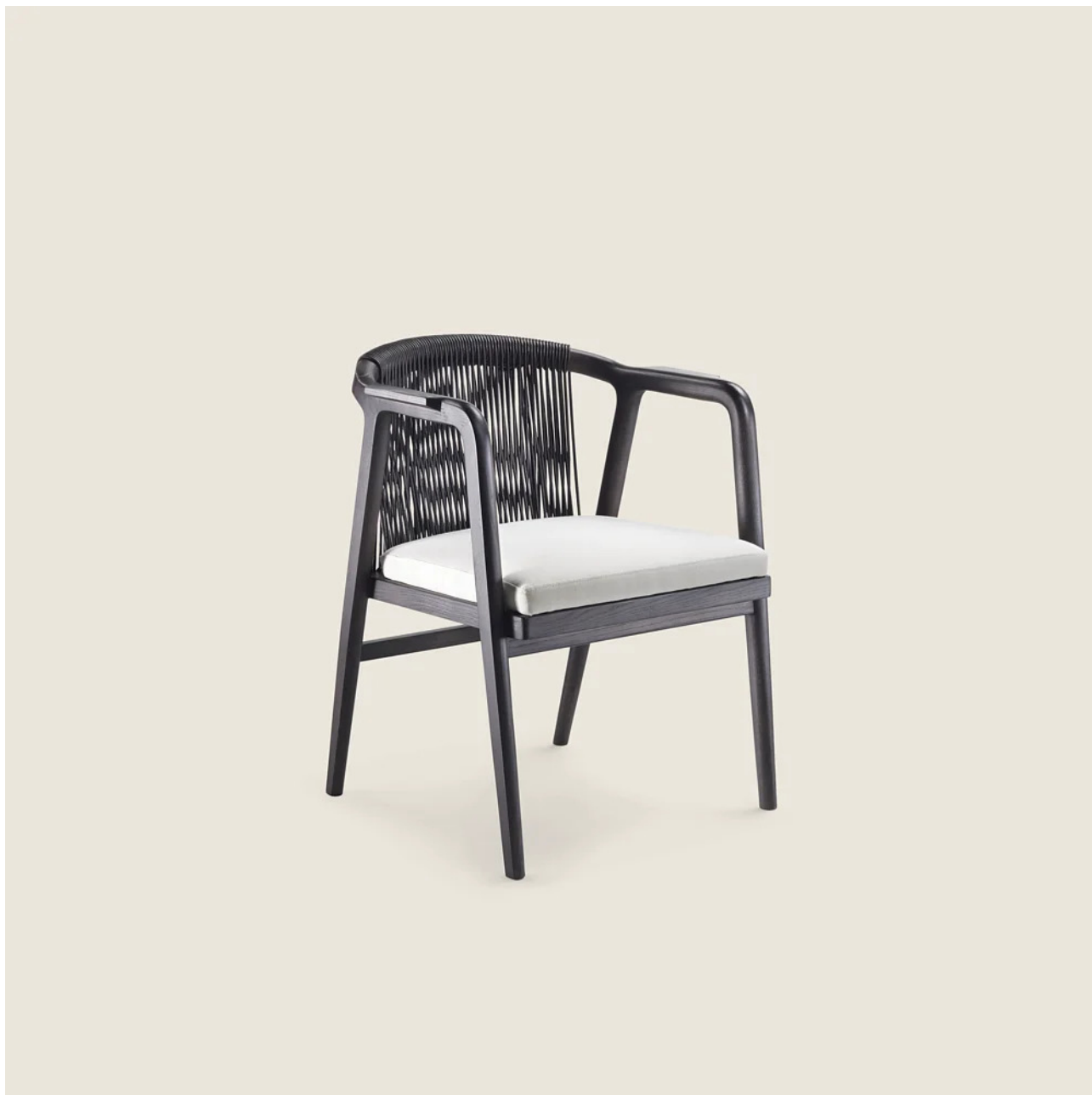
CRONO ANTONIO CITTERIO 2015 DINING CHAIRS/CHAIRS