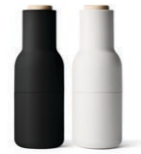
ASH / CARBON 4415399