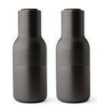
BRONZED BRASS 4415859