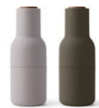
HUNTING GREEN / BEIGE 4415459