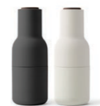
ASH / CARBON 4415369