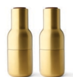
BRUSHED BRASS 4415839