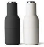
ASH / CARBON 4415599