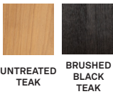
UNTREATED TEAK BRUSHED BLACK TEAK