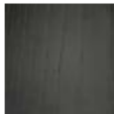
Charcoal-dyed Chestnut (Indoor)