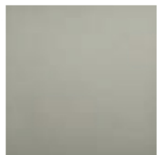
Cement Effect Finish col. Scuro (In-Outdoor)