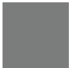
Scratch-resistant Lacquered Matt NCS S 6000-N Grey (In-Outdoor)