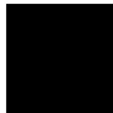
Scratch-resistant Lacquered col. Matt Black (In-Outdoor)