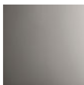
polished stainless steel