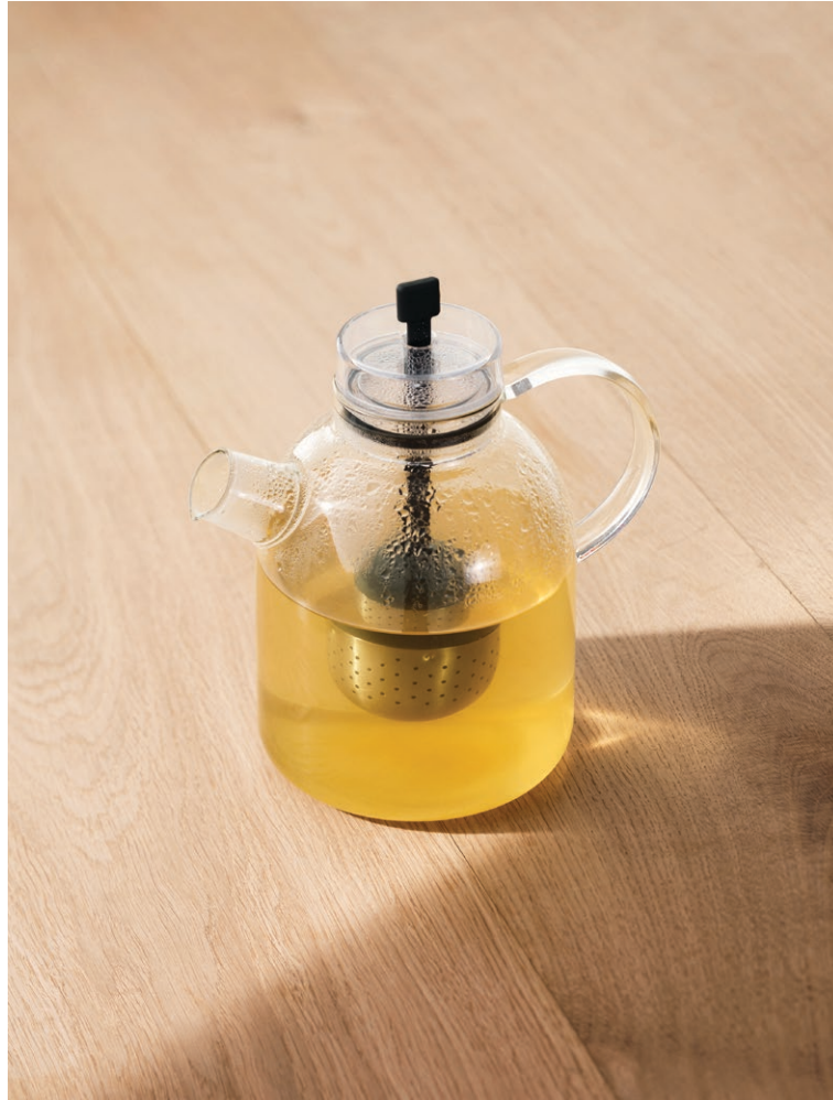
KETTLE TEAPOT Designed by Norm Architects