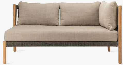
LENTO MODULAR CORNER LEFT