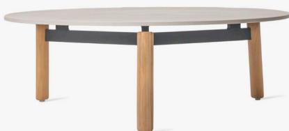
LENTO COFFEE & SIDE TABLES