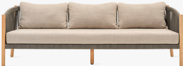
LENTO LOUNGE SOFA 3S