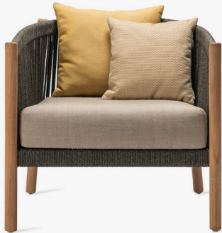
LENTO LOUNGE CHAIR