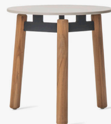
LENTO COFFEE & SIDE TABLES