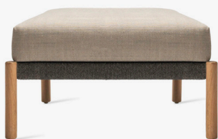
LENTO MODULAR COFFEE TABLE