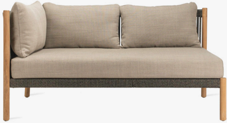
LENTO MODULAR CORNER RIGHT