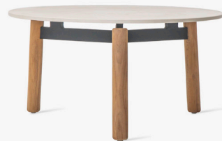
LENTO COFFEE & SIDE TABLES