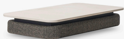
LENTO MODULAR CONNECTING SIDE TABLE