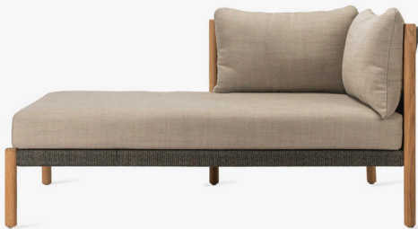
LENTO MODULAR CHAISE LONGUE LEFT