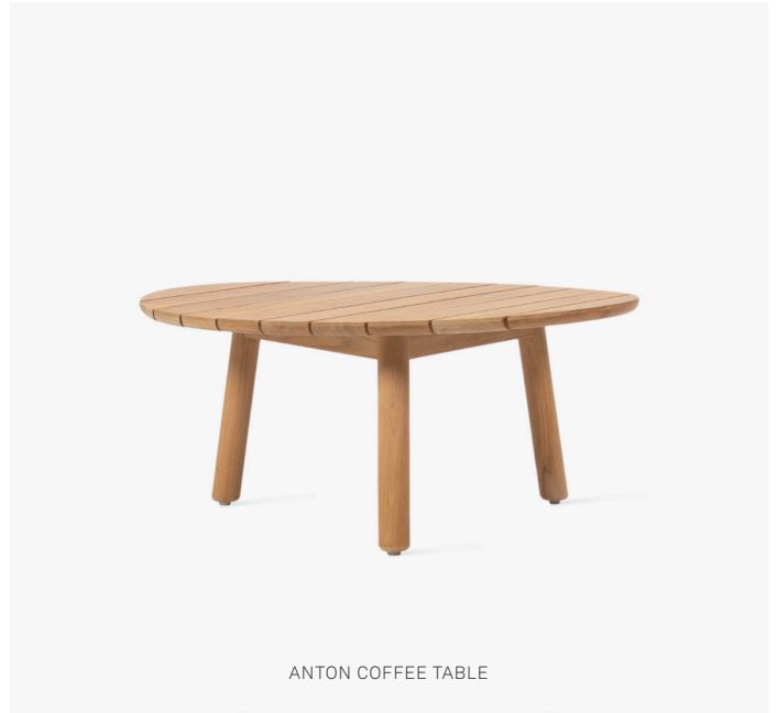
ANTON COFFEE TABLE