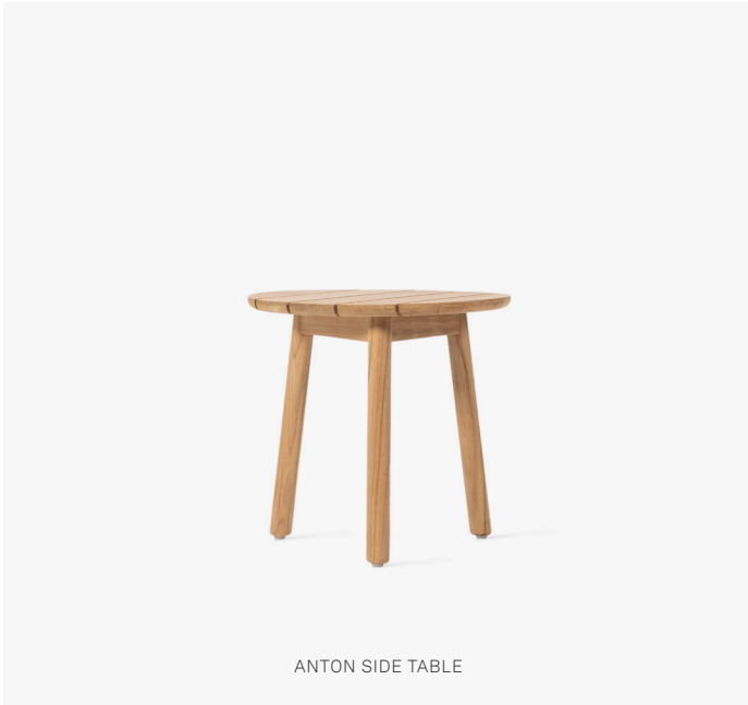
ANTON SIDE TABLE