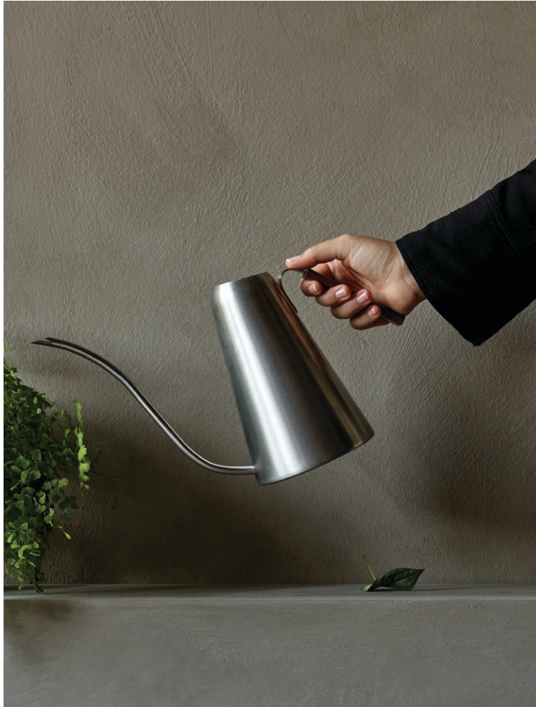
HYDROUS WATERING CAN Designed by Audo