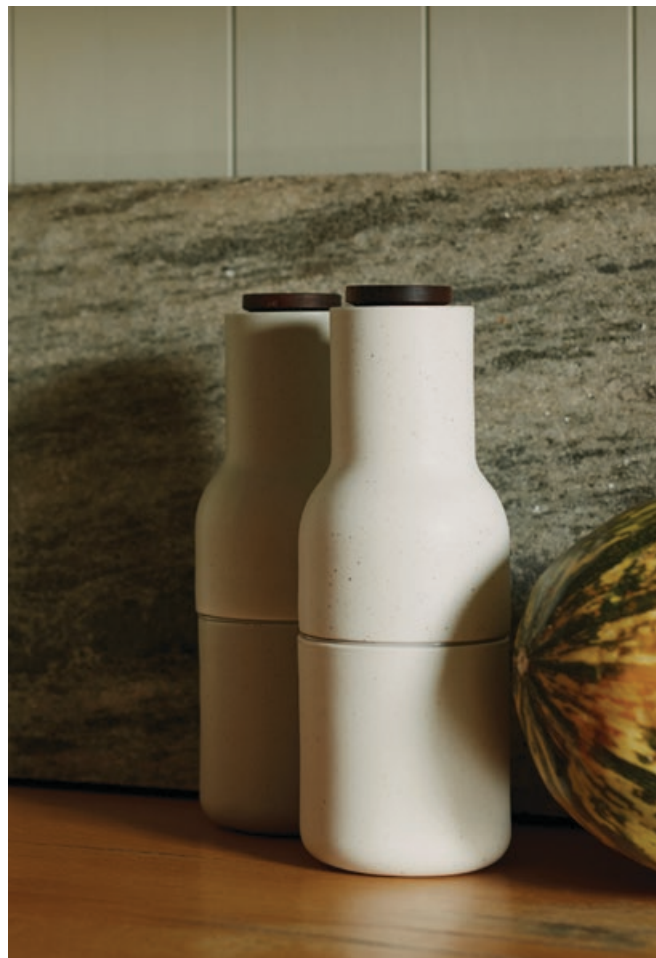
Bottle Grinders, Ceramic, by Norm Architects

Atypical for traditional salt and pepper mills, MENU's Bottle Grinders are shaped like bottles to cleverly trick the user into engaging with the design in a playful and experimental way. Fitted with a powerful ceramic mill that makes light work of grinding a wide range of spices, Bottle Grinders are easy to operate, fill and clean, and the upright design ensures surfaces remain free from unwanted residue. Available in a range of colours and finishes, the collection's most recent additions are carefully crafted from ceramic, featuring an ivory or grey matte glaze finish that displays small, deliberate imperfections for a handmade look and feel. The versatile kitchen accessories come fitted with a harmonising walnut wood lid.