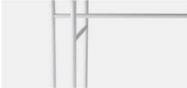
LIGHT GREY STEEL